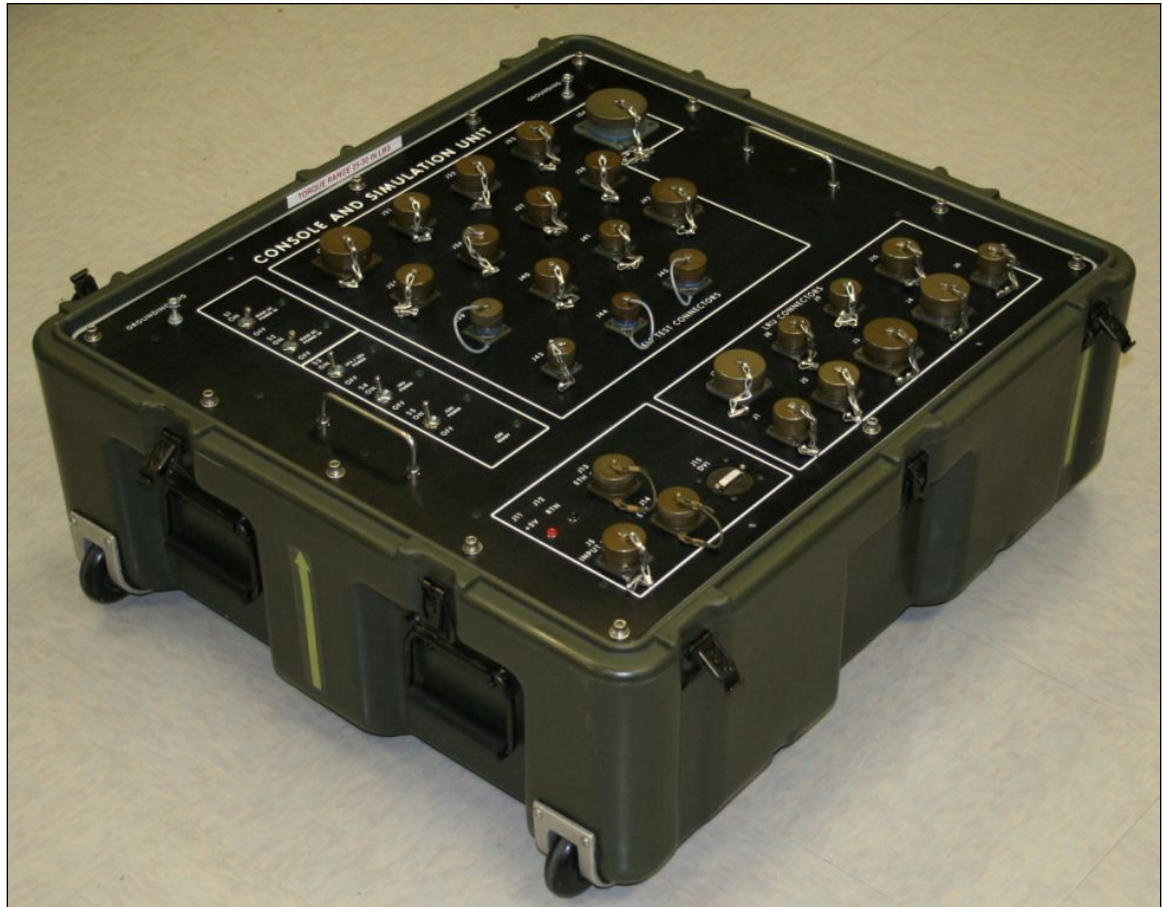
Figure 1: CSU Portable Test Instrument

Field-testing and troubleshooting of military equipment is critical for combat readiness. However, this requires that test systems be rugged and portable. Equipment that could normally be used inside a laboratory might not meet the environmental or size requirements for field testing. The need to minimize the test time and test errors is also magnified for field testing versus testing in a laboratory environment.